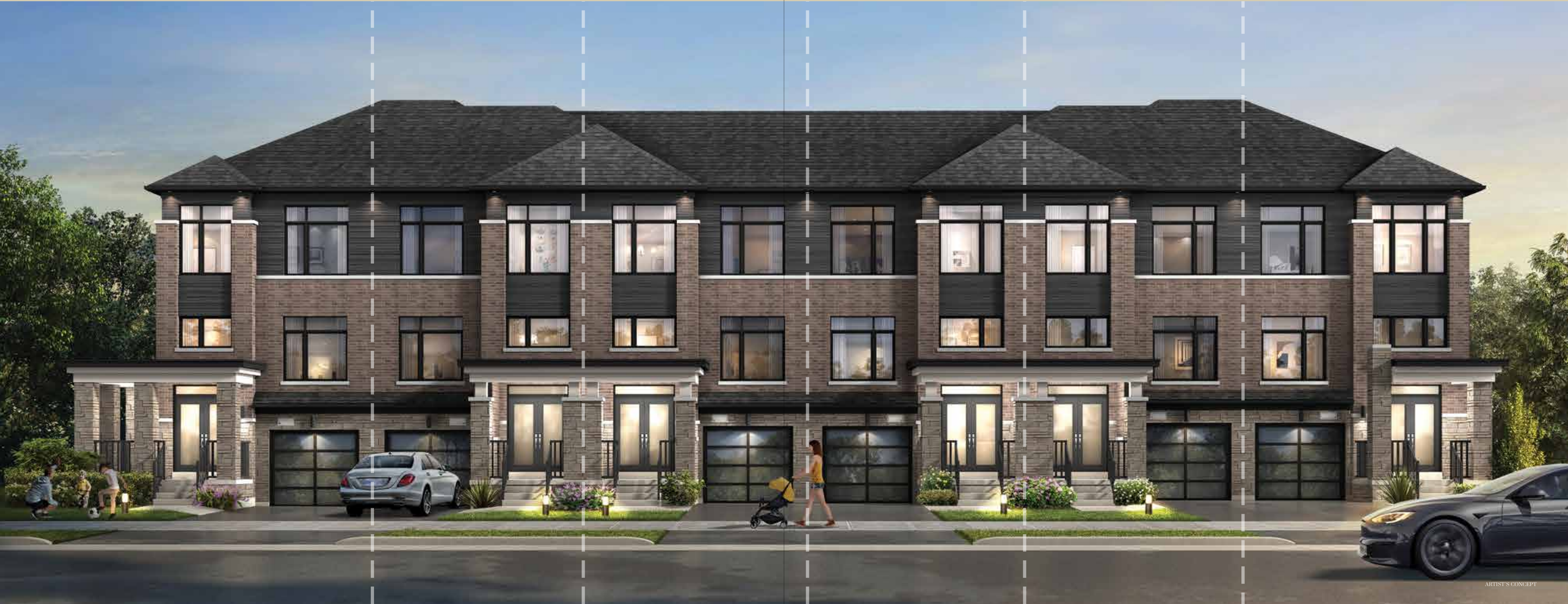
THE REDWOOD CORNER 2204 sq.ft.